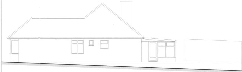
Before Side Elevation - 1:100