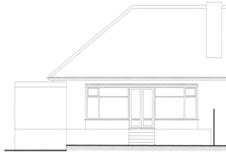
Before Rear Elevation - 1:100